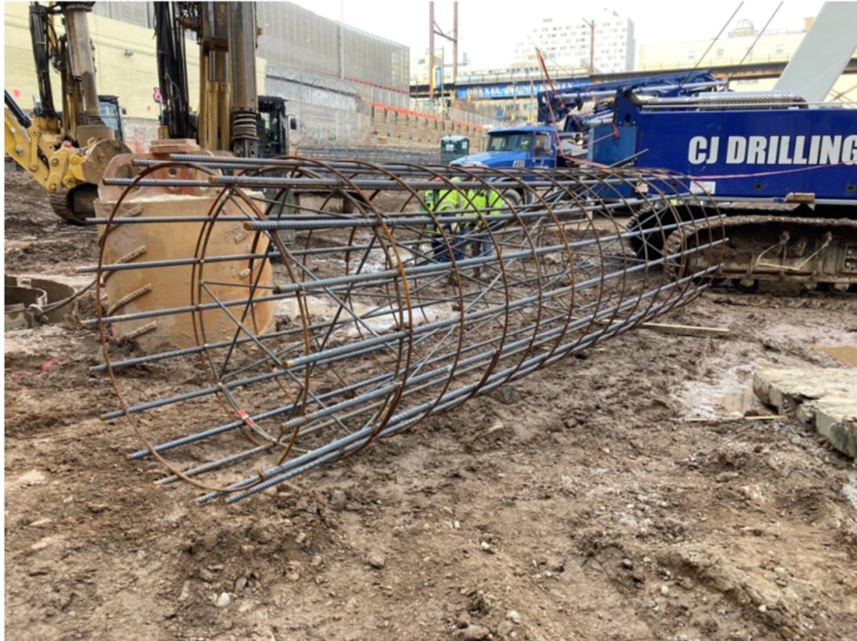
Figure 5: Drilled Pier Rebar Cage