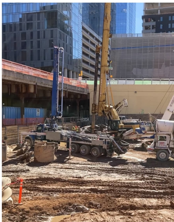
Figure 4: Construction of Drilled Piers