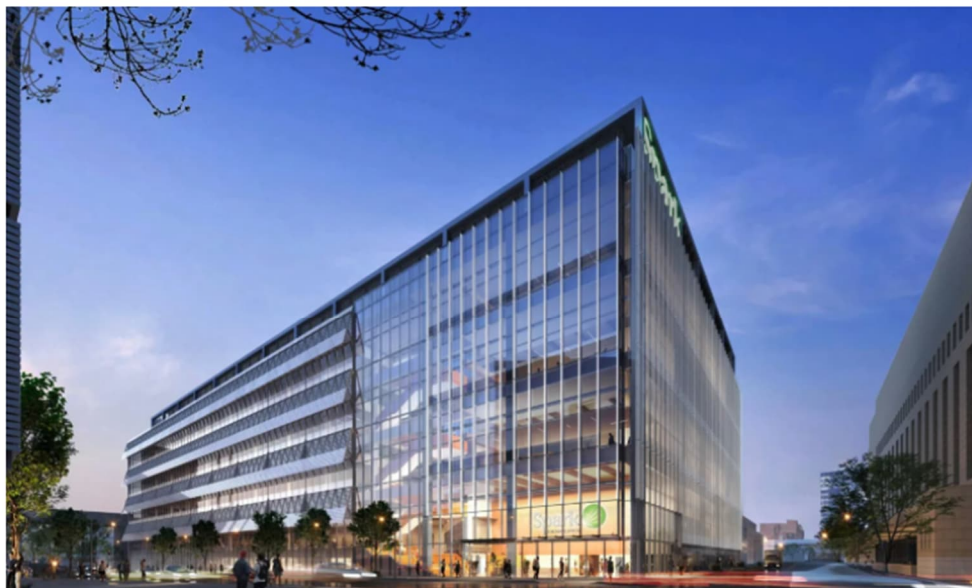
Figure 2: Rendering of the Structure