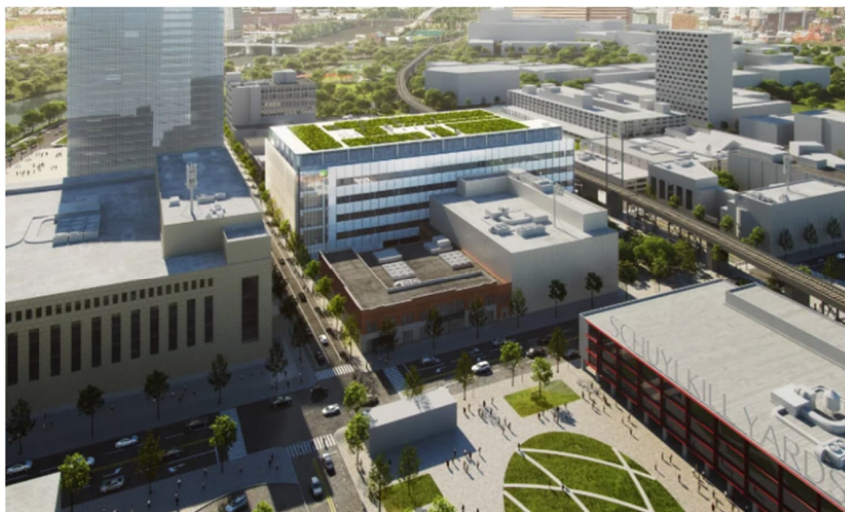
Figure 3: Northeast Aerial View