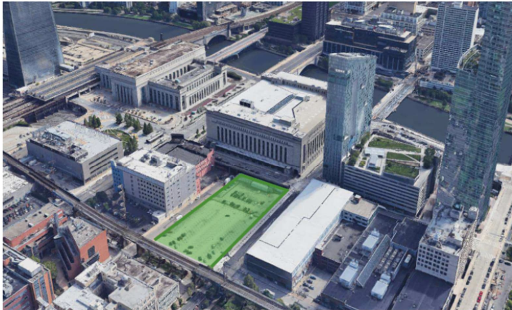
Figure 1: Site Location, 30 th & Chestnut Streets, Philadelphia, PA