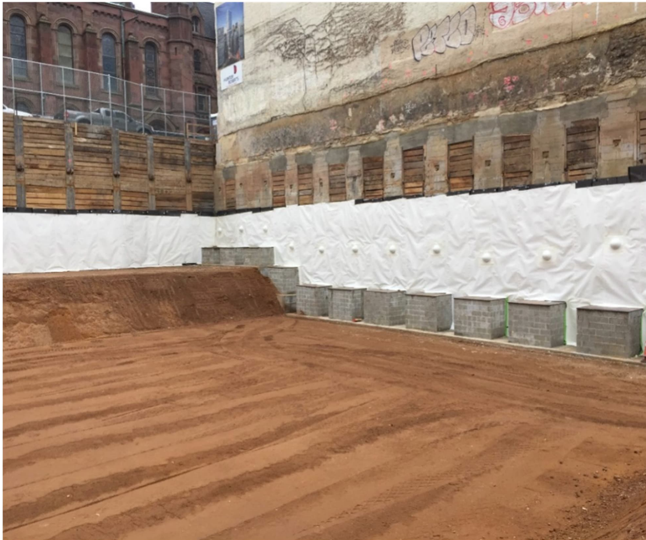
Figure 3: Enclosures with steel plate covers around micropile caps at the intermittent underpinning piers to create a 3-in. gap below mat (GeoStructures, Inc., 2018).